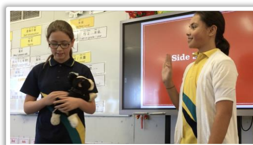
Performing a co-constructed short script in modelled language

Brass coins can be used to redeem items in the Chinese shop. Chinese shop offers a range of choice snacks enjoyed in Asian countries as well as laminated A4 posters, bookmarks and a small range of Asian craft items. Pre-Primary students will earn points to redeem for a non-edible item from a prize box. In addition, there are group points to award the whole class for achieving excellent team learning. Group points will go towards a fun activity of the respective group's choice.