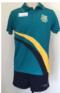
Teal Polo - Kindy to Year 5