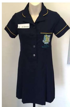
Girls School Dress

Items being returned for exchange MUST NOT have been worn or washed, and a record of purchase must be on the student account within the month of purchase.