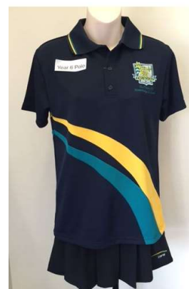
Navy Polo - Year 6 only