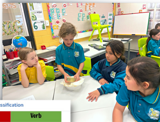
In response to: Personal Response - PWIM Word Classification